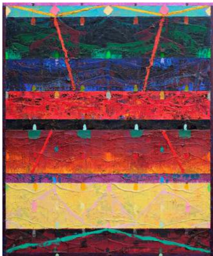
1. DIAGONAL PLAY , 2012 – 13