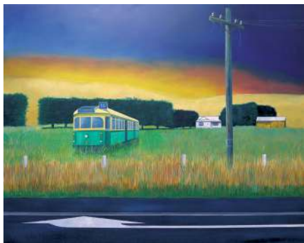
14. END OF THE LINE , 2018