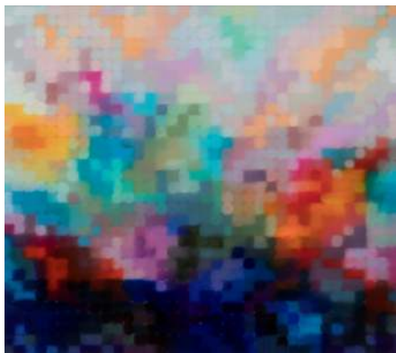
8. EFFUSSIO SRATUM III , 2018 (INDICATIVE IMAGE ONLY)